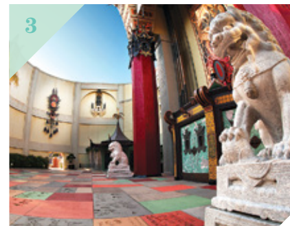
Grauman's Chinese Theatre Exterior Ornamentation