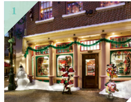
Muppets Courtyard It's a Wonderful Shop Storefront