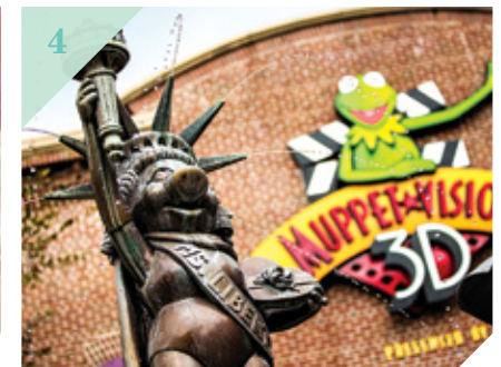
Muppet★Vision 3D Miss Piggy Statue