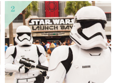
Star Wars Launch Bay Marquee Emblem