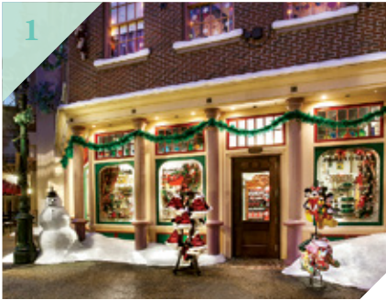
Muppets Courtyard It's a Wonderful Shop Storefront