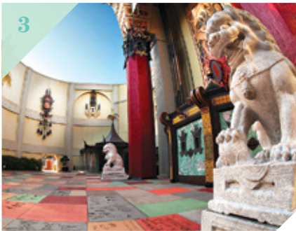
Grauman's Chinese Theatre Exterior Ornamentation