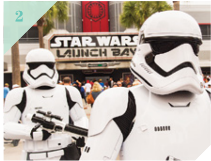
Star Wars Launch Bay Marquee Emblem