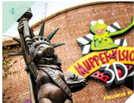
Muppet★Vision 3D Miss Piggy Statue