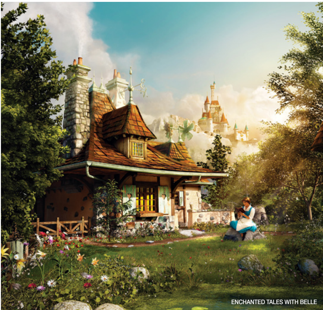
ENCHANTED TALES WITH BELLE