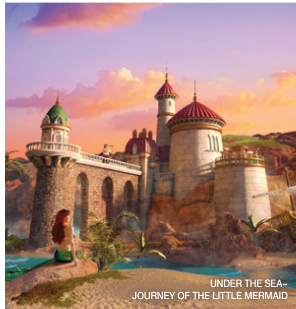
UNDER THE SEA~ JOURNEY OF THE LITTLE MERMAID