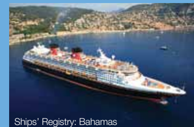
Ships’ Registry: Bahamas

Now Passholders can discover the magic of Disney Cruise Line ® European itineraries through a new online video. This enchanting new video offers a glimpse into all the experiences you’ll enjoy when you take in the legendary sights of Europe with Disney Cruise Line .