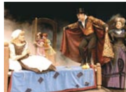
"Twice Charmed" introduces a new Disney villain—Franco Di Fortunato, the fairy Godfather to Cinderella's stepmother.

"Twice Charmed" is exclusively on Disney Cruise Line 7-night cruises, so you may want to book one soon.