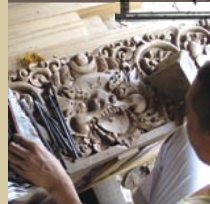
The fascinating relationship between Himalayan culture and the Yeti is woven into the meticulous details you'll see at the new attraction.