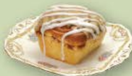
Warm Cinnamon Roll