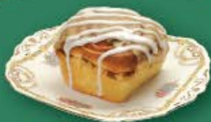
Warm Cinnamon Roll