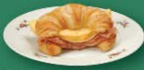
Ham, Egg, and Cheese Croissant